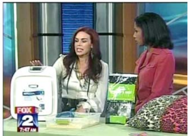
Detroit Fox 2