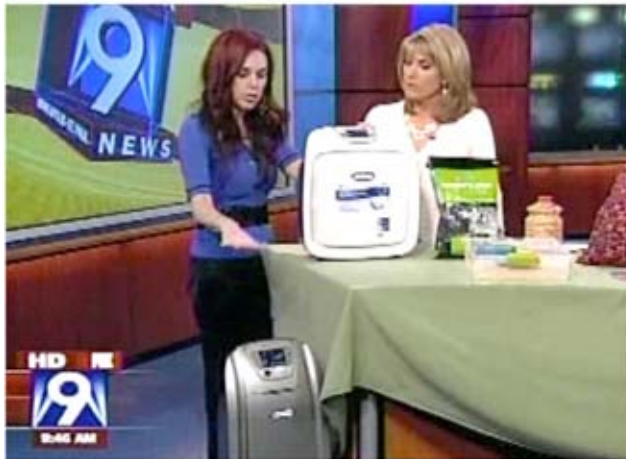
Minneapolis Fox 9