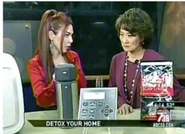
San Diego NBC 7