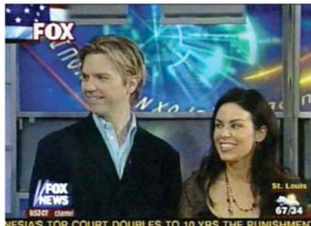
"Fox & Friends"