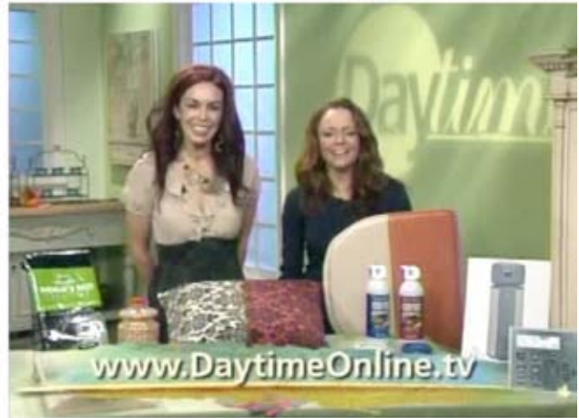
Tampa Daytime NBC