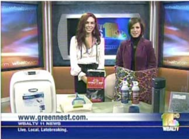
Baltimore NBC 11