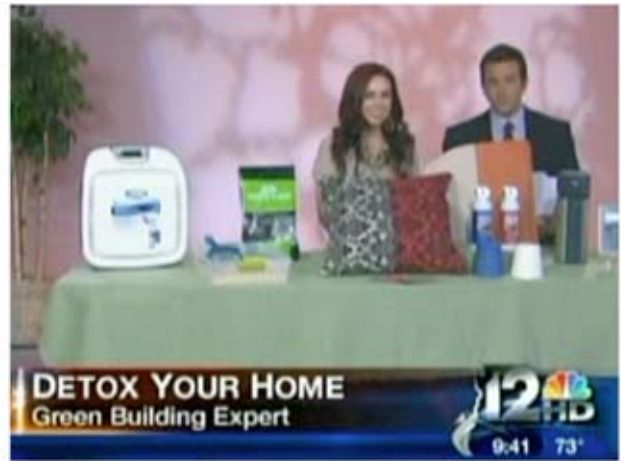
Phoenix NBC 12