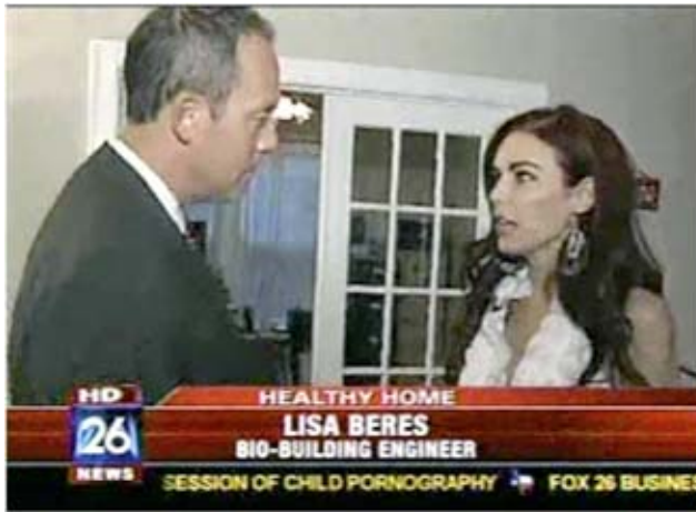
Houston Fox 26