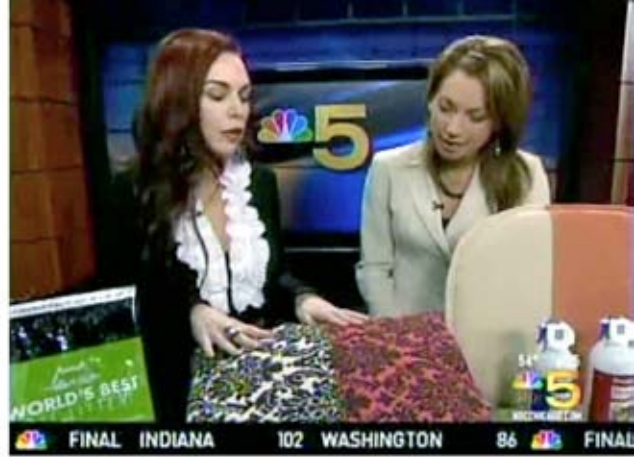
Chicago NBC 5