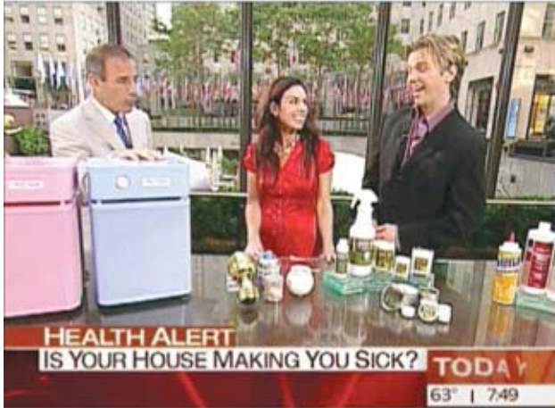
"The Today Show" with Matt Lauer