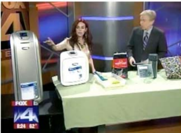
Dallas Fox 4