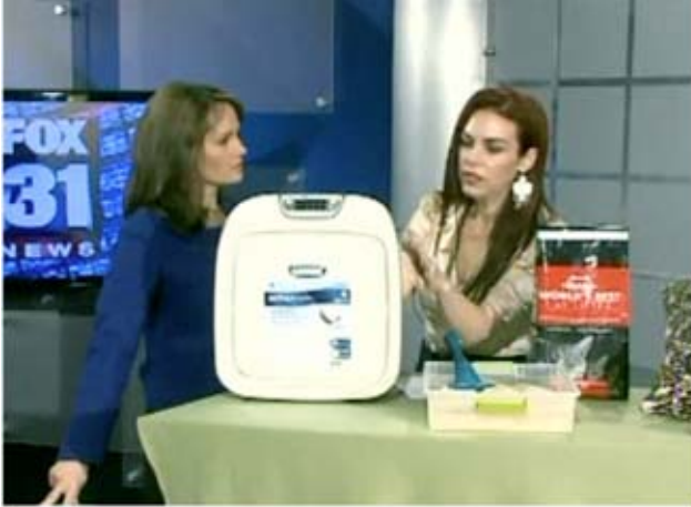
Denver Fox 31